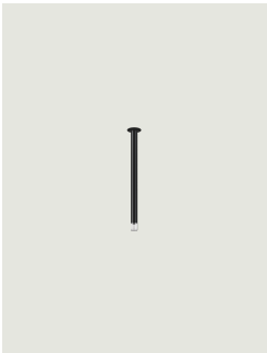
A-Tube Nano Swing small